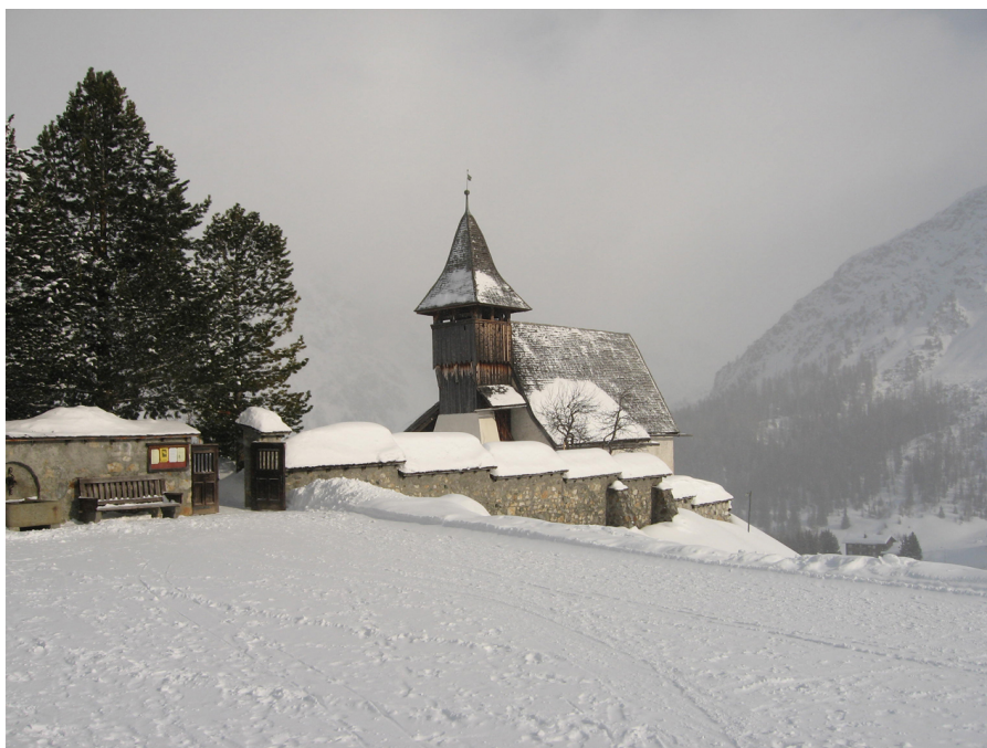
Fig. 2 Bergkirchli in Arosa (built 1492)

Such a heavenly inspiration of Schrödinger to find his equation describing the “music of atoms and molecules” can at best claim circumstantial evidence, although it is known that, for instance, Einstein’s attitude towards science as a means of understanding the world had a strongly religious component (Quack M, 2004), not so different from the inspiration drawn by writers of “real music” such as Bach (Quack M, 2004, 2012a). This is, however, only one of several attitudes to be found with scientists, motivating their research as a route towards discovering fundamental underlying truths of the world. Another, more modest attitude aims at just providing fruitful models of the world, but in the end these two approaches may be closer relatives than obvious at first sight (Quack M, 2014). Independent of the particular philosophy of research, it deserves support as a basic part of our culture to understand and shape the world in which we live.